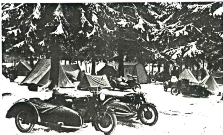
'The Elephant Rally' GERMANY